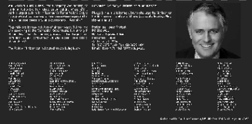
Advertisement that recently ran in Malcolm Turnbull's local paper, the Wentworth Courier

IS MALCOLM TURNBULL THE MINISTER FOR THE ENVIRONMENT OR THE MINISTER AGAINST THE ENVIRONMENT?